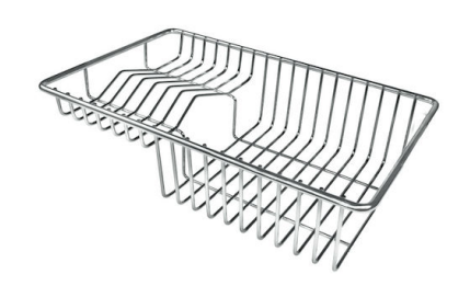
Stainless steel plate rack