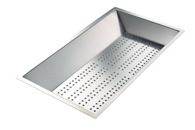
Stainless steel perforated tray